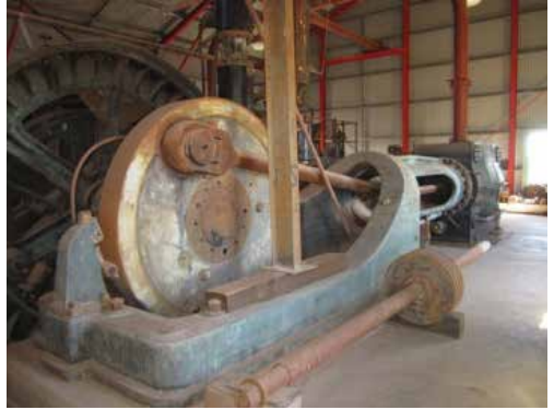
The Winder Engine

In celebrating Australia's engineering heritage, Engineers Australia (EA) has a Heritage Recognition Program which focuses the attention of both engineers and the general community on the role played by engineers and engineering in the development of the nation. It also encourages the physical conservation of Australia's important engineering heritage works. The program is managed by the national body Engineering Heritage Australia (EHA), and is assisted by affiliated committees in each of the EA divisions across Australia eg. Engineering Heritage WA (EHWA).